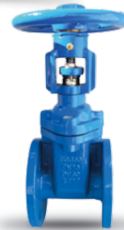
SERIES 11A RESILIENT SEAT GATE VALVES.

Made of Ductile Iron GJS500. Non Rising Stem. PN 16/25 from DN 40 to DN 1000. Flanged Ends DIN PN 10/16/25.