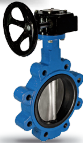
SERIES 22A BUTTERFLY VALVES LUG TYPE. Made of Ductile Iron GJS400. Disc made of Ductile Iron GJS400 & St. Steel AISI 316. PN 10/16 ANSI#150 from DN 50 to DN 300. Construction EN 558-1 series 20.