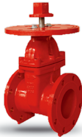
SERIES 11A RESILIENIT SEAT GATE VALVES. Made of Ductile Iron GJS400. Non-Rising Stem. UL-FM Certificate. PN 10/16 from DN 32 to DN 500. Construction EN 558-1 series 3.