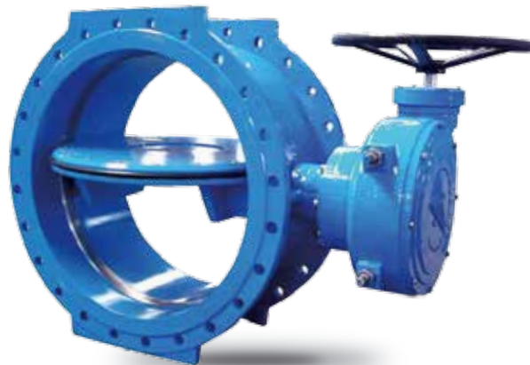
SERIES 24A DOUBLE ECCENTRIC BUTTERFLY VALVES. Made of Ductile Iron GJS400 & GJS500. Construction DIN 3202 F-4/BS5155. PN 10/16/25/40 from DN 200 to DN 2000. Flanged Ends DIN PN 10/16/25/40.