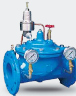
SERIES 53A CONTROL VALVES. Made of Ductile Iron GJS500. Construction UNE EN-1074-5. PN 10/16/25 from DN 50 to DN 400. Multiple applications.