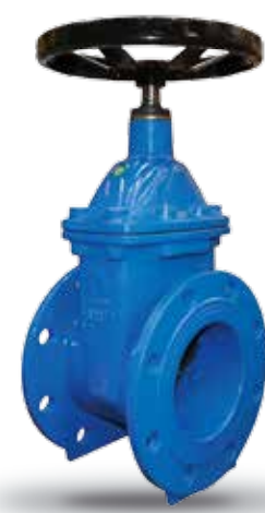
SERIES 11A RESILIENT SEAT GATE VALVES.

Made of Ductile Iron GJS500. Non Rising Stem. PN 16/25 from DN 40 to DN 1000. Flanged Ends DIN PN 10/16/25.