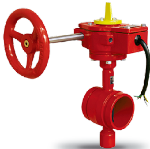
SERIES 25A BUTTERFLY VALVES GROOVED TYPE. Made of Ductile Iron GJS400. UL-FM Certificate. Limit switches included. Construction ANSI/AWWA C606.