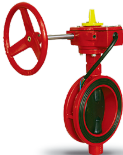
SERIES 21A BUTTERFLY VALVES WAFFER TYPE. Made of Ductile Iron GJS400. UL-FM Certificate. Limit switches included. Face to face distance ASME B16.1.