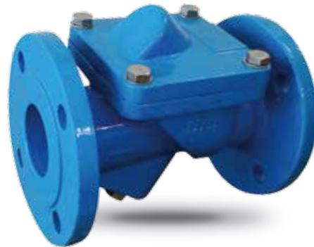
SERIES 32A SWING CHECK VALVES. Made of Ductile Iron GJS500. Resilient seat. PN 10/16/25 from DN 50 to DN 600. Flanged Ends DIN PN 10/16.