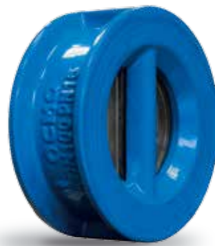
SERIES 33A DUAL PLATE CHECK VALVES. Made of Grey Iron GJL250. Discs made of Ductile Iron GJS400 & St. Steel AISI 316. PN 10/16 from DN 40 to DN 600. Face to face distance EN 558-1 series 16.