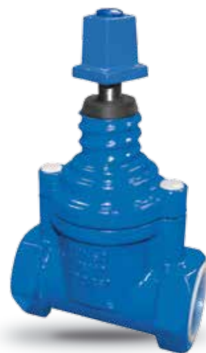
SERIES 12A RESILIENT SEAT GATE VALVES.

Made of Ductile Iron GJS500. Rising Stem. PN 10/16 from DN 50 to DN 600. Flanged Ends DIN PN 10/16.