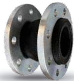
SERIES 41A RUBBER EXPANSION JOINTS. Simple / Twin sphere reinforcement ring. Joint made of EPDM/NBR. Flanges of cadmium steel. PN 10/16 from DN 15 to DN 2000. Threaded & Flanged Ends DIN PN 10/16 ANSI#150.