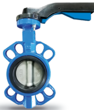
SERIES 21A BUTTERFLY VALVES WAFFER TYPE. Made of Ductile Iron GJS400. Disc made of Ductile Iron GJS400 & St. Steel AISI 316. PN 10/16 ANSI#150 from DN 40 to DN 600. Construction EN 558-1 series 20.