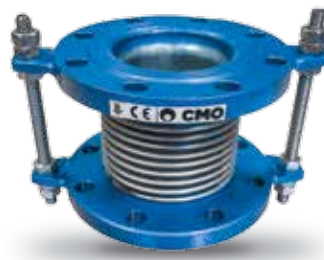
SERIES 42A COMPENSATORS. Made of St. Steel / Carbon Steel. PN 10/16 from DN 15 to DN 600. Flanged & Welding Ends PN 10/16.