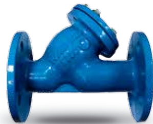
SERIES 43A "Y" STRAINERS. Made of Ductile Iron GJS450. Screen St. Steel AISI 304. PN 10/16 from DN 40 to DN 600. Flanged Ends DIN PN 10/16.