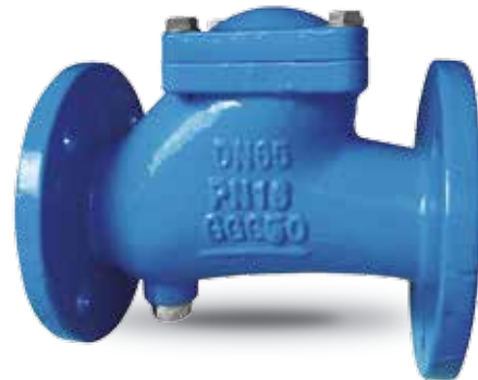
SERIES 31A BALL CHECK VALVES. Made of Ductile Iron GJS500. Construction DIN 3202 F-6. PN 10 from DN 32 to DN 500. Threaded & Flanged Ends DIN PN 10/16.