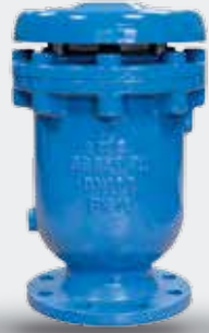
SERIES 51A TRIPLE FUNCTION AIR VALVES. Made of Ductile Iron GJS500. Internals made of St. Steel AISI 304. PN 10/16/25 from DN20 to DN300. Threaded & Flanged Ends DIN PN-10/16.