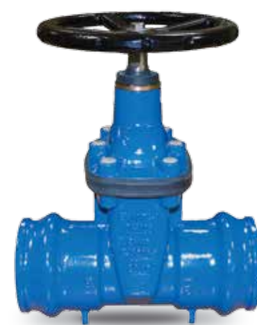
SERIES 13A RESILIENT SEAT GATE VALVES.

Made of Ductile Iron GJS500. Horizontal Port. PN 16 from DN 3/4" to DN 2". Threaded Ends DIN 259.