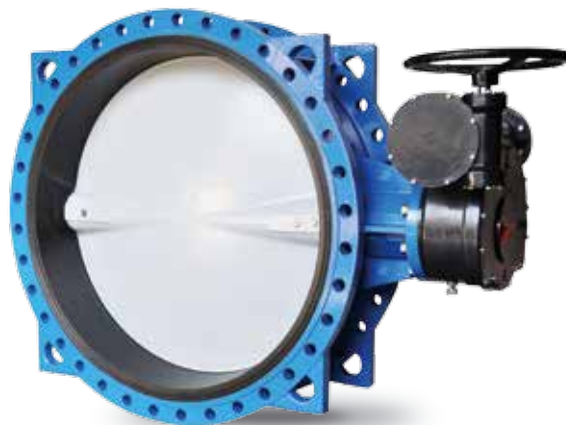
SERIES 23A CONCENTRIC BUTTERFLY VALVES. Made of Ductile Iron GJS400. Disc made of Ductile Iron GJS400 & St. Steel AISI 316. PN 10/16 from DN 50 to DN2200. Flanged Ends DIN PN 10/16.