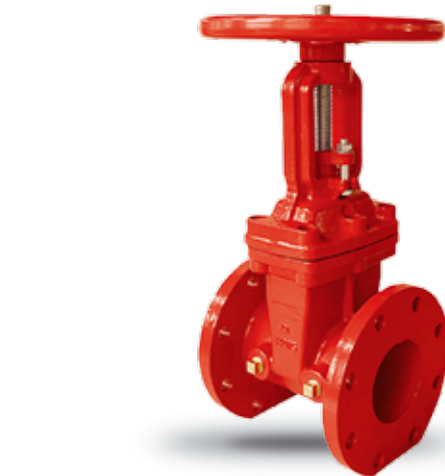
SERIES 11A RESILIENIT SEAT GATE VALVES. Made of Ductile Iron GJS400. Rising Stem. UL-FM Certificate. PN 10/16 from DN 50 to DN 300. Construction EN 558-1 series 3.