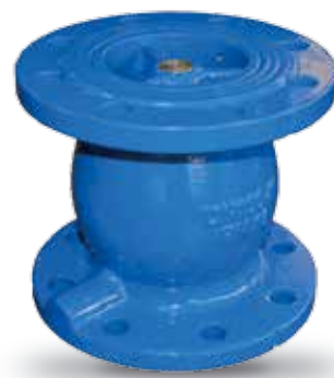
SERIES 35A AXIAL CHECK VALVES. Made of Ductile Iron GJS500. Construction EN 558-1 serie 14. PN 10/16 from DN 50 to DN 600. Flanged Ends DIN PN 10/16.