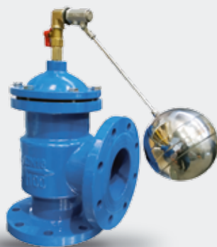
SERIES 52A FLOAT VALVES. Made of Ductile Iron GJS500. Internals made of St. Steel AISI 304. PN 10/16 from DN50 to DN150. Flanged Ends DIN PN-10/16.